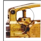
Ease-On Cutting Valve