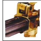
Brazed Triangular Tube Design