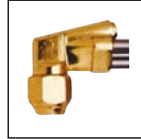
Solid Forged Head