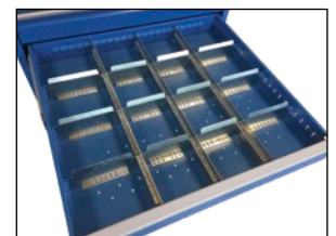
FN409 (Dividers only, partitions and cabinet not included)