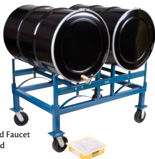
DC386 Drip Pan and Faucet Not Included